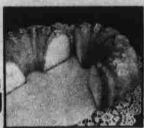
AMARETTO CAKE "We specialize in all kinds of liquor cakes!"

1083 E. TROPICANA AVE. LAS VEGAS, NV, 89101 (702) 736-4306