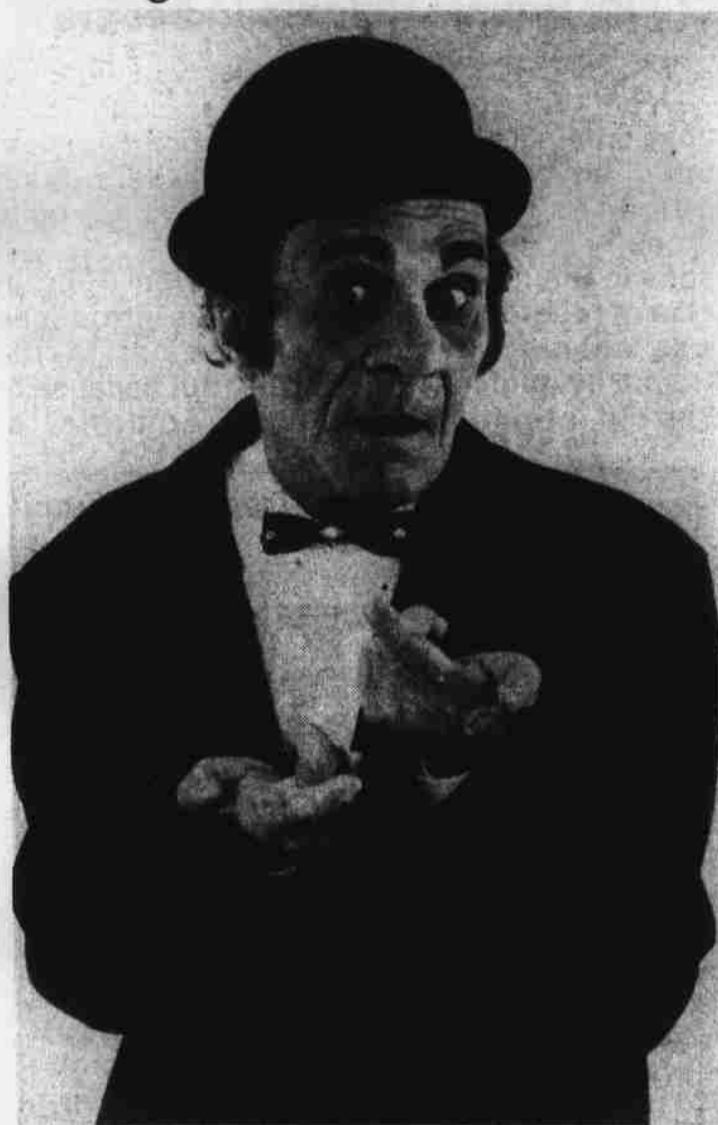
"Knockouts," starring top banana George Carl, is the newest show to be added in the Riviera Hotel and Casino's entertainment line up. "Knockouts" can be seen three times nightly at 7:30, 9:30 and 11:30 p.m. in the Mardi Gras Entertainment Center. Price is $9.50 for dinner and show. For information, call 734-5300.