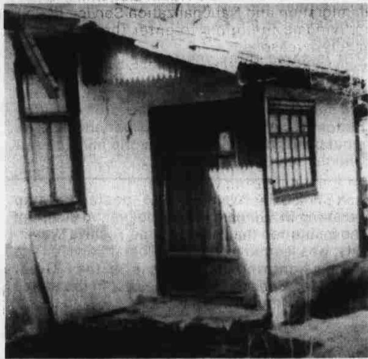
This ramshackle house, part of which is a private home, serves as the only surviving official locale for Jewish prayer in Donetsk, the Ukraine, according to the Student Struggle for Soviet Jewry. Of the two synagogues still open in the 1920s, one was turned into a puppet theater, and the other a museum. There are only about 55 synagogues permitted to function today in the USSR for its 3,000,000 Jews. (Information furnished by Student Struggle For Soviet Jewry, 210 West 91st Street, New York, N.Y. 10024 (212) 799-8900.)