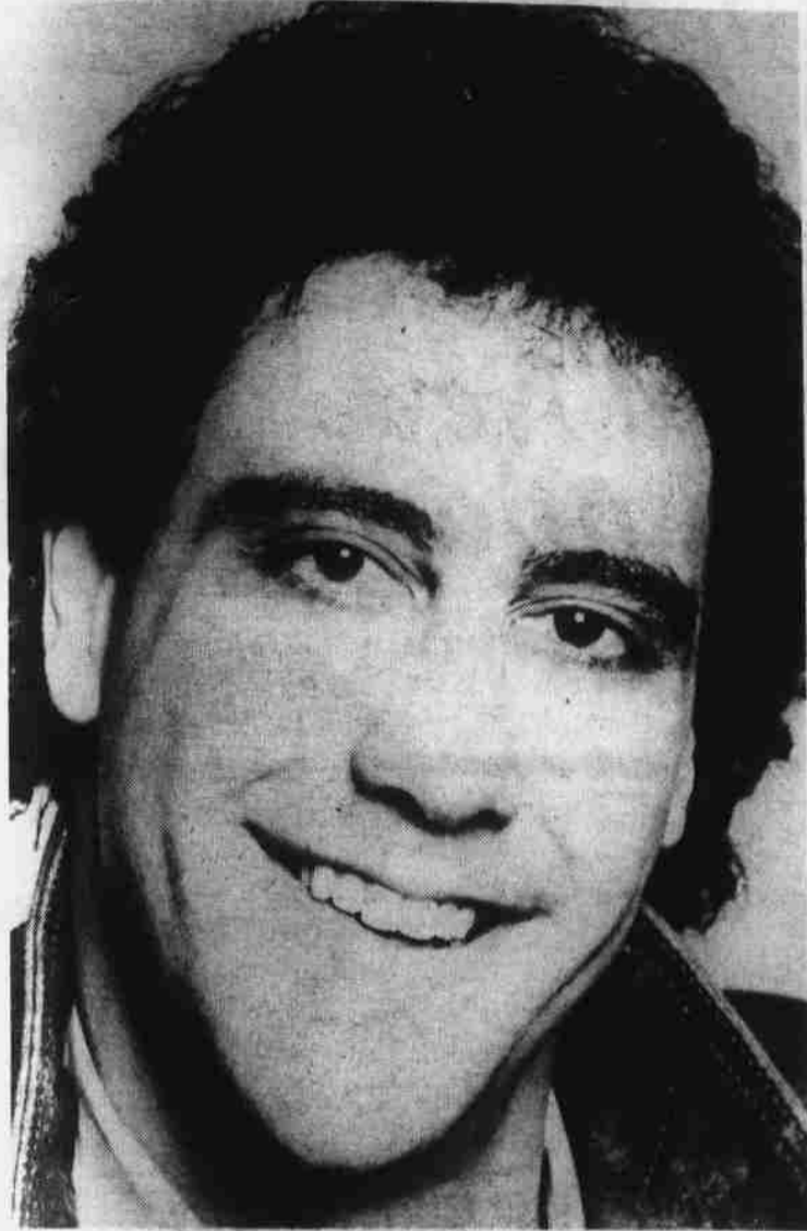
Brad Garrett, who won "Best New Comedian of 1984" on "Star Search," makes his Las Vegas debut at the Desert Inn Hotel & Casino opening for Crystal Gayle. The pair are featured in the Crystal Room through September 24. Garrett has also been featured in "People Magazine" as one of the "Top Ten New Comedians" for 1984. He and Crystal Gayle appear nightly except Monday. For reservations, call 733-4566.

Did you know that Swensen's make HOME MADE ice cream on the premises?