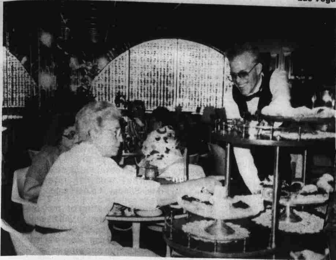
ORT Donors enjoying the delicious pastry.