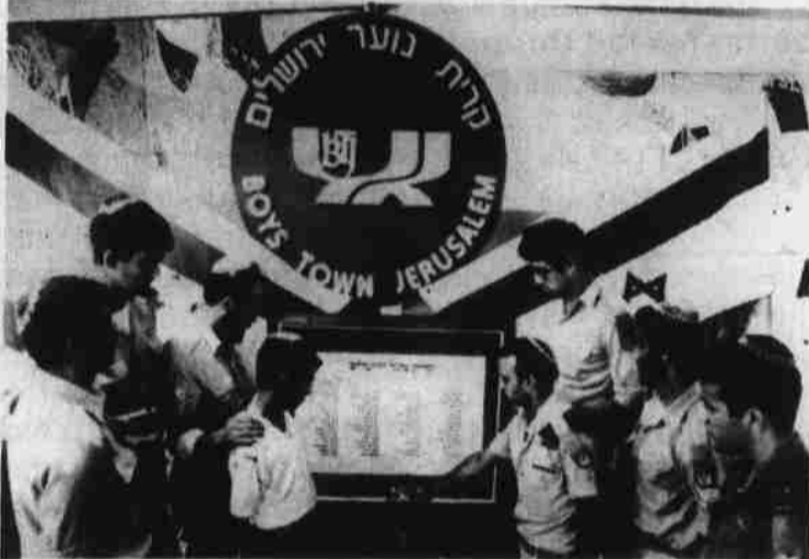
JERUSALEM — Boys Town Jerusalem alumni, serving in the Israel Defense Forces, light a memorial candle for their 62 fellow alumni who fell during military service.