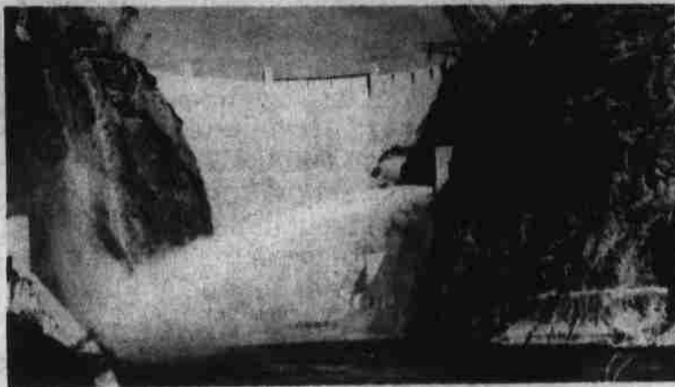
Hoover Dam, 35 miles from Las Vegas, puts on its own show as water gushes across a 100-yard-wide canyon through six-foot needle valves. The single most popular visitor site in Southern Nevada, it produces hydroelectric power and irrigation water from Lake Mead for the Southwest.