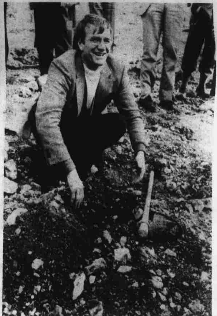
Maxim Shostakovich, son of renowned Russian composer Dmitri Shostakovich, participates in tree-planting ceremonies at a new JNF grove in Jerusalem honoring his father.

A grove of trees honoring the renowned Russian composer Dmitri Shostakovich has been established in Jerusalem's Neveh Ya'akov neighborhood by the Jewish National Fund, responsible for afforestation and land reclamation in Israel.