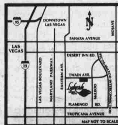
(Southeast corner of Twain and Eastern)

2807 East Seabridge Drive Las Vegas, Nevada 89121 (702) 369-2265