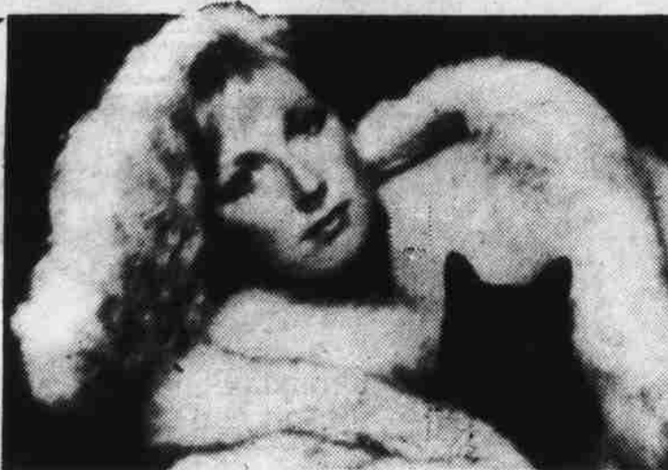
In Commercial Center