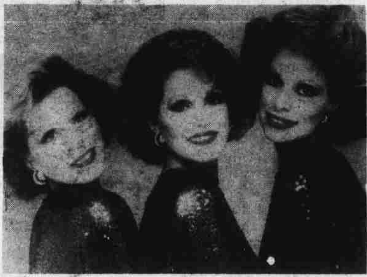
The McGuire Sisters, recently busy with several national television appearances, will be playing the Desert Inn Crystal Room through November 27. They are opening act for Bobby Vinton. For reservations, call 733-4566.