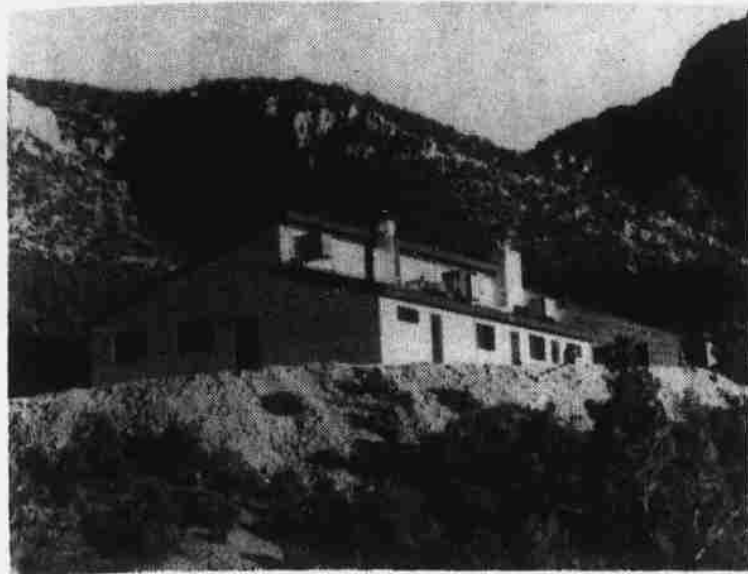
MAJESTY OF THE LAND...is illustrated graphically in this view of the Keyers Training Center at Boy Scouts Camp Potosi.

Boulder Dam Area Council, Boy Scouts of America, officially dedicated Camp Potosi, its newest project, at an evening ceremony on the property recently.