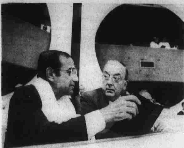
Senator Chic Hecht and Senator Jesse Helms during prayer service in the Hecht Synagogue on the Mount Scopus campus of the Hebrew University of Jerusalem.