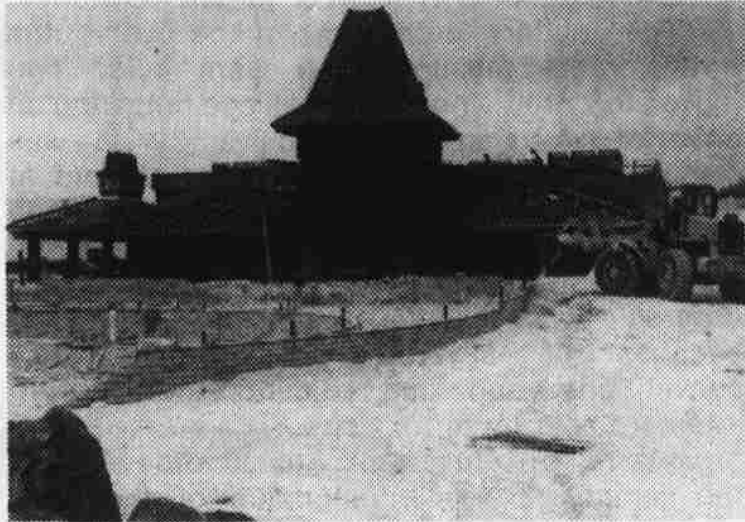
Scandia Family Fun Center in Las Vegas - under construction.