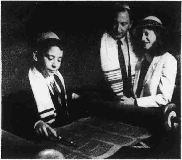
Photograph by Marvin