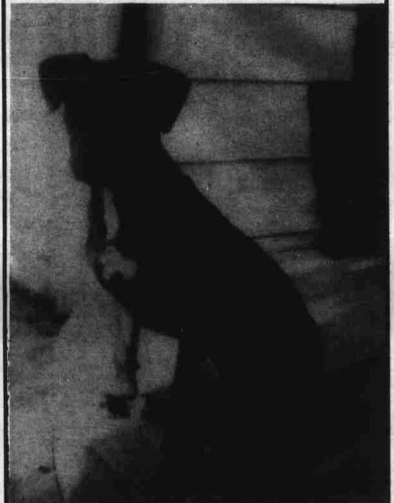
This very cute female Pit Bull Terrier is registered. She was born on 2/4/85. She is very gentle. Her name is "VICKY." This dog will make a great pet.

Call the Humane Society of Southern Nevada at 382-4799 Monday thru Friday between 10-4 for adoption services. The Humane Society of Southern Nevada does not charge fees for its animals but we do make sure they go into proper homes. You will be required to register the animal with us on our Computer Pet Registration Program.