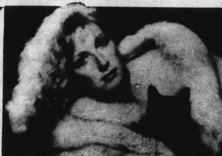
In Commercial Center