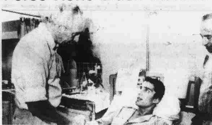
Jerusalem...Israel Prime Minister Shimon Peres visits Avi, one of the four Israeli soldiers wounded in the crash of a helicopter in a remote desert region, as Avi's father looks on. Surgeons at the Hadassah-Hebrew University Medical Center worked around the clock to minimize the permanent effects of the soldier's injuries. All, except a young soldier now paralyzed from the waist down, are expected to recover fully. The full names of soldiers on active duty with the Israel Defense Forces are withheld for security reasons.