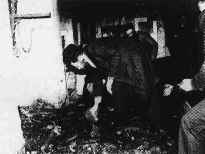
The Chevra Kadisha (Burial Society) sorts through the remains of the Holy Scrolls On Mount Zion.

Rebbeim from all over Israel came to eulogize the destruction. They included the Gerrer Rebbe; the Belzer Rebbe; Rabbi Shapira, chief Rabbi of