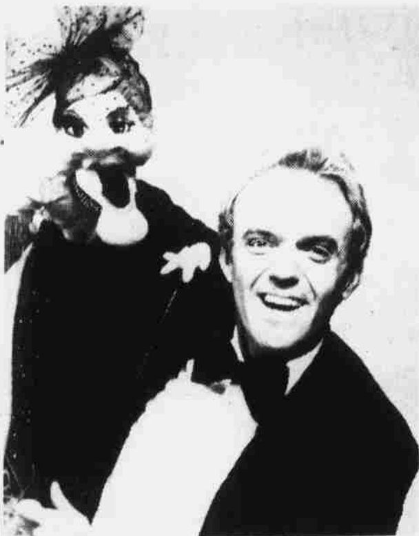
WAYLAND & MADAME -- The popular off-beat comedy team of Wayland Flowers and Madame bring their unique blend of humor and wit to the Desert Inn stage as they join the musical variety show, "One Of A Kind" nightly except Monday.