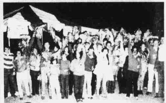
Participants in the Alumni Association's Tailgate party for the recent UNLV and Fullerton game show their support for the Rebels. Valley Bank of Nevada showed their support by donating 8,000 "Silver Shakers" to Rebel fans at the recent game.