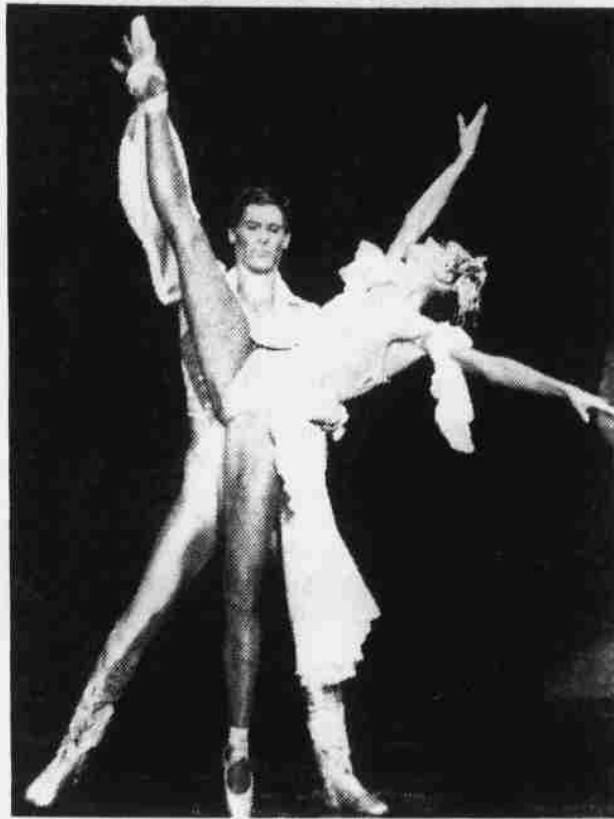
Although Donn Arden's "JUBILEE!" in the Ziegfeld Room of the MGM Grand, is scheduled for a total run of ten years, the audience continues growing as word of mouth gets around. "Jubilee!" is presented twice a night, at 7:30 and 11, every night but Wednesday, when the showroom is dark.