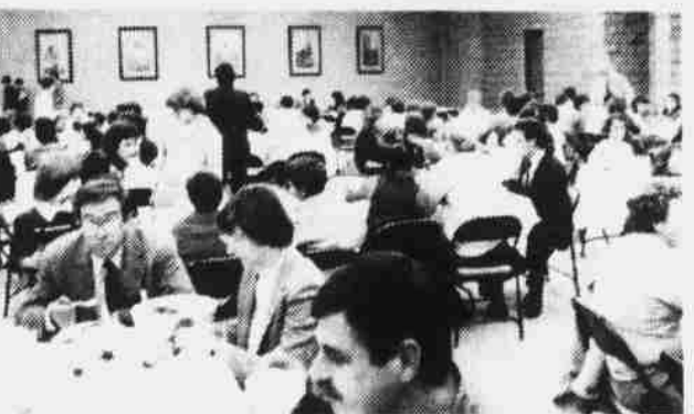
Shabbat dinner for local families and 125 visiting teens & advisors. 194 people attended dinner.