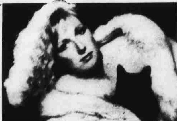
In Commercial Center