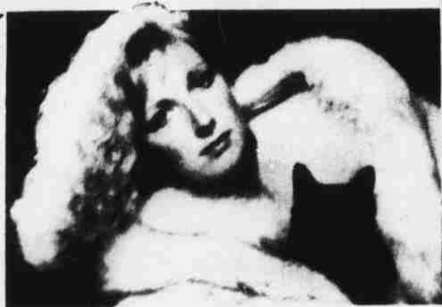
In Commercial Center