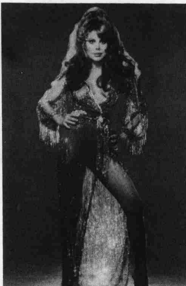
Red hot and lively Charo adds her own brand of excitement to the Las Vegas Hilton's spectacular "Bal du Moulin Rouge." For reservations call 732-5755.

being held separately and had no contact with each other. The envoy said he did not know the locations that he was taken to for the meetings with the prisoners except that they were in or near Damascus.