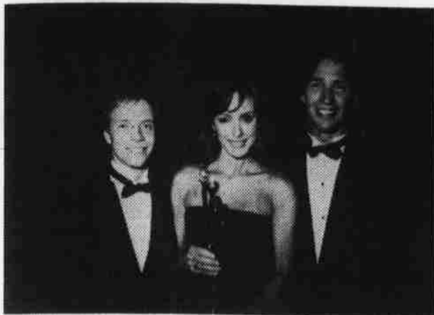
A TRIO OF OLYMPIC GOLD MEDALISTS help glamorize Victor Awards XVIII, which will be televised Saturday, July 28, at 8:30 P.M. on KTNV. From left, are: Scott Hamilton, winner of the figure skating competition at Sarajevo; Peggy Fleming, also a figure skating champion; and Bill Johnson, the first American to win a gold in Alpine (downhill) skiing.

The Victor Awards, a star-studded, two-hour TV special tribute to the men and women who have made the greatest contribution to sports, will be seen on KTNV in Las Vegas, at 8:00 P.M. on Saturday, July 28.