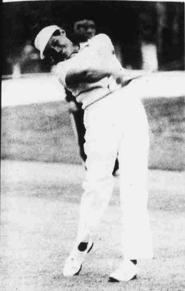
DEFENDING CHAMP — Nancy Lopez returns to the Desert Inn Country Club and Spa April 12-15 to defend her championship in the $200,000 J&B Scotch Pro-Am. The field boasts 96 women pros and 288 amateurs, including 38 top celebrities. Proceeds from the LPGA event benefit Big Brothers and Big Sisters of Southern Nevada. Tickets are on sale in the DI golf shop.