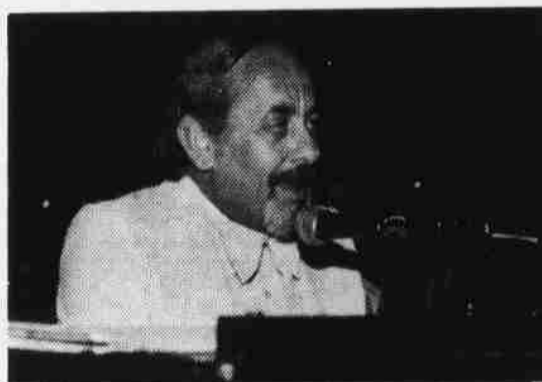
YOEL SHARR, ISRAELI STAR, WAS THE SPECIAL GUEST PERFORMER. HE IS SHOWN ABOVE PERFORMING AND SINGING AT THE PIANO WITH MASTERFUL SHOWMANSHIP AND VIRTUOSITY.