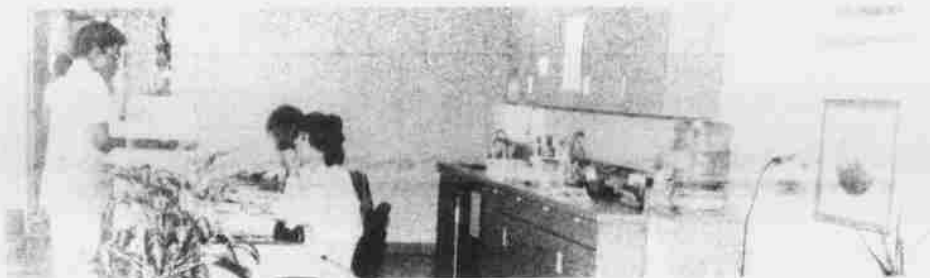
Reception area of 50,000 square foot medical complex staffed by 20 primary physicians and 50 referral specialists.

Health Plan is currently being offered as a group medical services alternative to employers of twenty - five (25) or more employees and to all Clark County Medicare Beneficiaries who are covered under Part B (Medical Services). Additional information is available through HPN administrative offices located at 801 South Rancho Drive, 382-2883.