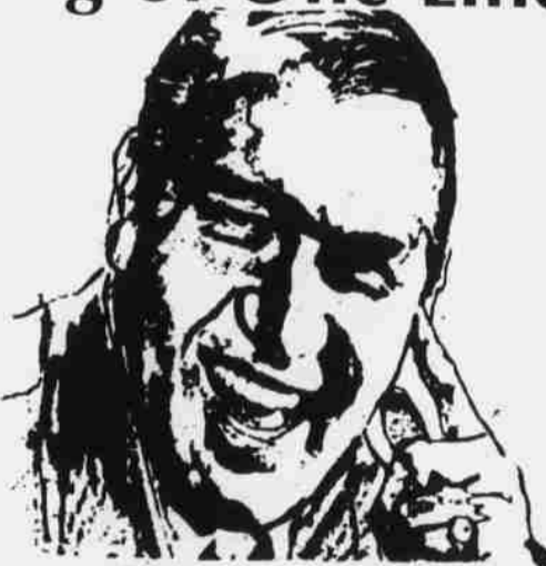
HENNY YOUNGMAN ...Man of Many Talents.

IF, AS THE SCIENTISTS SAY, SEX IS SUCH A DRIVING FORCE, WHY IS SO MUCH OF IT NOWADAYS FOUND PARKED?