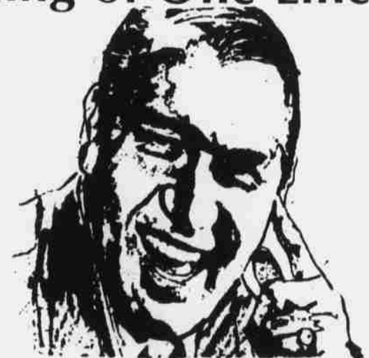
HENNY YOUNGMAN ...Man of Many Talents.

A GIRL SHOULD USE WHAT MOTHER NATURE GAVE HER BEFORE FATHER TIME TAKES IT AWAY.