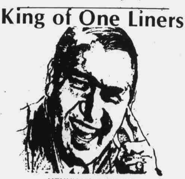
HENNY YOUNGMAN ... Man of Many Talents.

JERUSALEM (WNS) -- At an emotional concluding session in the Knesset, 125 American Jewish leaders participating in the United Jewish Appeal Prime Minister's Special Mission to Israel endorsed by acclamation a 1983 UJA special fund for humanitarian programs which are no longer supportable by Israel's people because of the cost of Israel's "Peace for Galilee" operation and which are being reassumed by the Jewish Agency. Pledges for 1982 announced at the Knesset totaled $10.6 million.