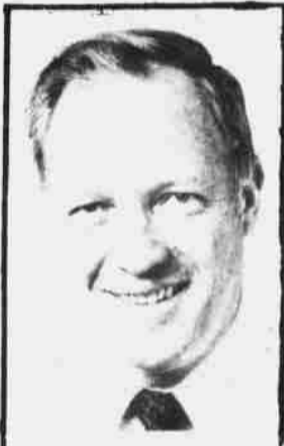
JIM MARSH ASKS

meter (25 miles) belt of terrorist artillery, had disappeared with the extension of the fighting to the suburbs of Beirut.