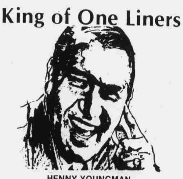
HENNY YOUNGMAN ....Man of Many Talents.

As to the position of the West, especially the U.S., doubt lingers whether an agreement can be reached in finalizing the treaty. The consensus here is that the majority will adopt (Continued on Page 14)