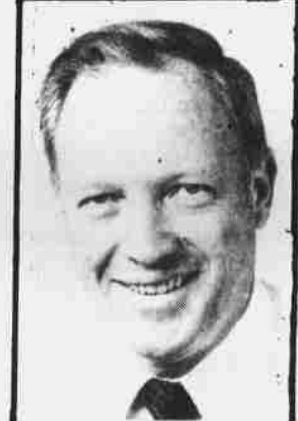
JIM MARSH ASKS

Meanwhile, more than 100 miles away in northern Israel, troops continued to man roadblocks around four Druze villages on the Golan Heights where the residents are in the third week of a general strike to protest Israel's annexation of the region. The army said that the villagers are free to move inside the towns but cannot leave or enter them. The press is also banned from the region.