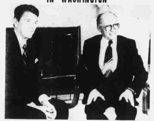
PRIME MINISTER MENACHEM BEGIN IN SPIRIT OF FRIENDSHIP.