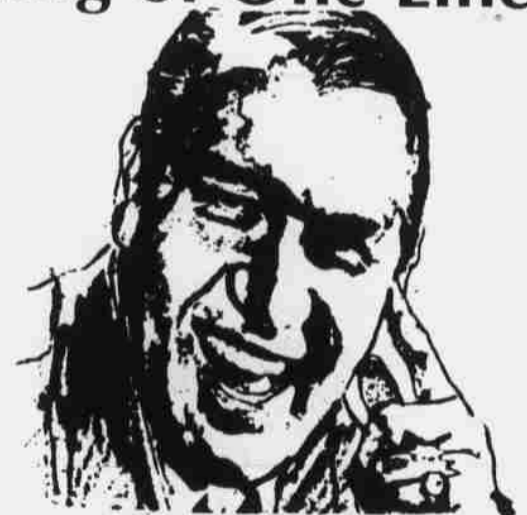
HENNY YOUNGMAN ...Man of Many Talents.

A WOMAN SAYS TO HER HUSBAND, 'SUPPOSE YOU CAME HOME ONE NIGHT AND FOUND ANOTHER MAN MAKING LOVE TO ME, WHAT WOULD YOU DO?' HE SAYS, 'I'D KICK HIS SEEING-EYE DOG!'