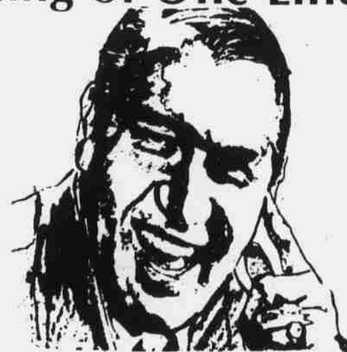
HENNY YOUNGMAN ...Man of Many Talents.