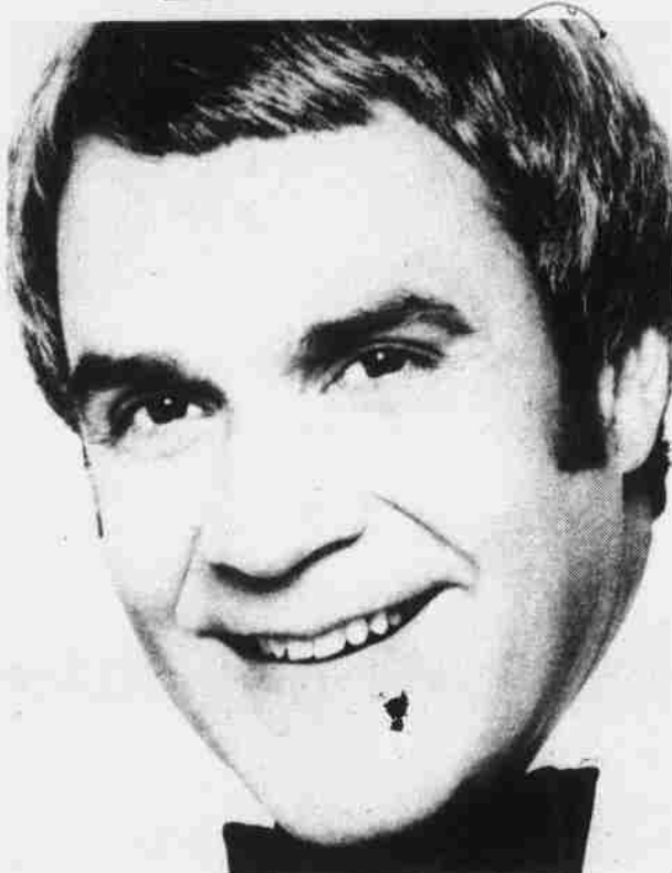
SAHARA DEBUT -- AMERICA'S TOP IMPRESSIONIST, MR. RICH LITTLE, IS STARRING IN HIS CONGO SHOWROOM DEBUT AT THE SAHARA HOTEL ALONG WITH THE FABULOUS SAHARA GIRLS IN TWO SHOWS NIGHTLY -- 8 P.M. DINNER SHOW AND 12 MIDNIGHT COCKTAIL SHOW -- FOR TWO BIG WEEKS. CALL 735 - 4242 FOR RESERVATIONS AND ENJOY THIS GREAT SHOW.

dialogue" with Islam. The plenary session, the WJC's first for six years, brings together some 500 Jewish leaders from 60 countries for a week of deliberations in Jerusalem. In a keynote address at the opening session, acting President Edgar Bronfman of New York said that Jews influence on government policymaking in Western states was becoming "less effective." In the U.S., he said, while Americans continued to admire and respect Israel as a lone democracy in hostile surroundings the new Reagan Administration "will no doubt strive to maintain Israel's strength and security; but it will probably view Israel as only one important factor in the global East - West struggle."