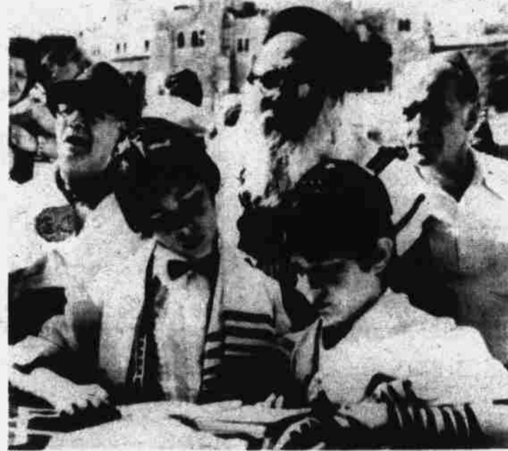
JERUSALEM, ISRAEL: MANY CHILDREN CELEBRATE BAT-AND BAR MITZVAHS IN MOVING CEREMONIES AT THE WESTERN WALL.

SUPPORT YOUR LAS VEGAS ISRAELITE Now In Its 16th Year