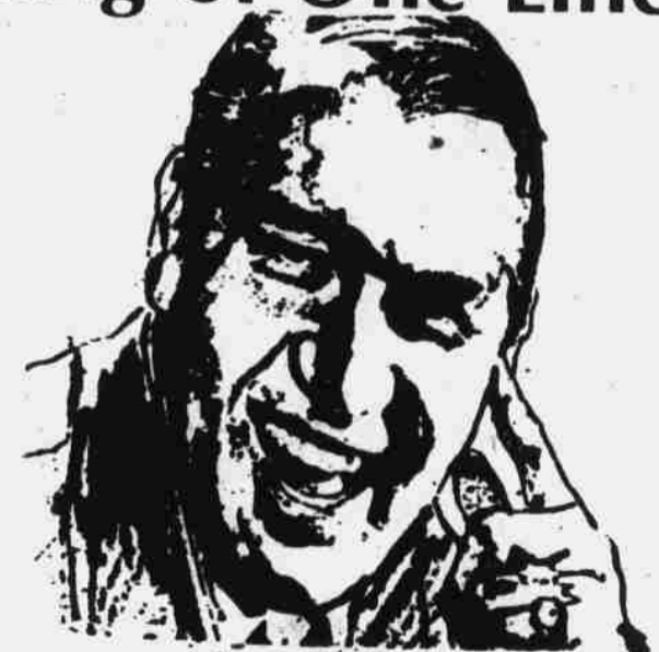
HENNY YOUNGMAN ...Man of Many Talents.

A WOMAN CALLED THE POLICE DEPARTMENT AND SAID, "I HAVE A SEX MANIAC IN MY APARTMENT. PICK HIM UP IN THE MORNING."