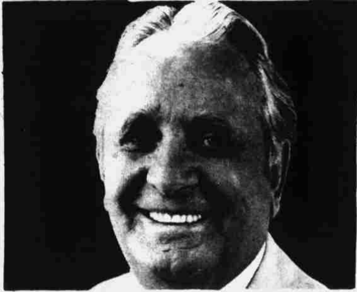
SEN. FLOYD LAMB

Vowing to continue his conservative fiscal policies, State Senator Floyd R. Lamb has filed for another term to the Nevada State Senate representing District Three.