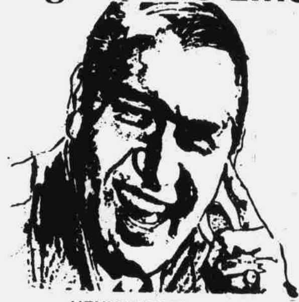
HENNY YOUNGMAN ...Man of Many Talents.

IN HOLLYWOOD THEY HAVE COMMUNITY PROPERTY. A COUPLE GETS DIVORCED, SHE GETS THE JAGUAR, HE GETS THE LITTLE CAR.