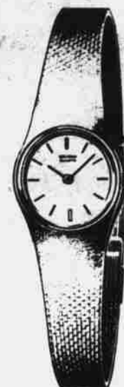
No. YL124M-$250.00. Yellow top/stainless steel back, gilt dial, HARDLEX mar-resist crystal.