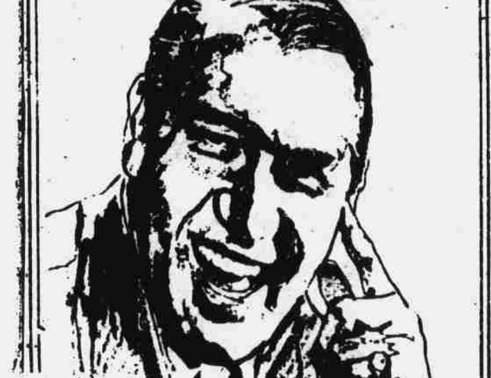
HENNY YOUNGMAN ...Man Of Many Talents

I DISCOVERED A NEW BIRTH CONTROL DEVICE.....MY WIFE TAKES OFF ALL HER MAKEUP.