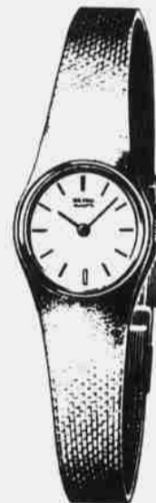
No. YL124M - $250.00. Yellow top/stainless steel back, gilt dial, HARDLEX mar-resist crystal.