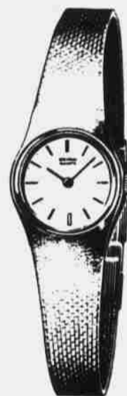
No. YL124M - $250.00. Yellow top/stainless steel back, gilt dial, HARDLEX mar-resist crystal.