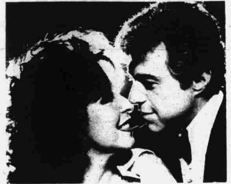
STEVE LAWRENCE AND EYDIE GORME STAR AT THE DESERT INN THROUGH JULY 20th.