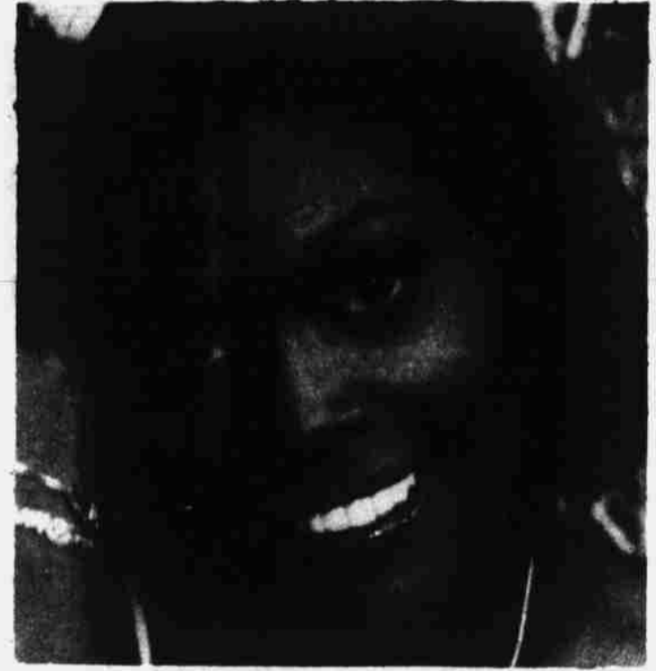
SUPER SONGSTRESS -- DIONNE WARWICK HAS RETURNED TO THE DESERT INN CRYSTAL ROOM FOR A SPECIAL TWO-WEEK ENGAGEMENT. SHE'LL BE SINGING THOSE MUSICAL CLASSICS THAT DELIGHT AUDIENCES THE WORLD OVER.

Mac Davis and Tom Dreesen star in the Celebrity Room through August 1.