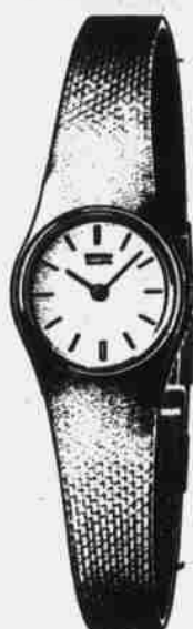
No. YL124M - $250.00. Yellow top/stainless steel back, gilt dial, HARDLEX mar-resist crystal.