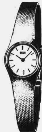
No. YL124M - $250.00. Yellow top/stainless steel back, gilt dial, HARDLEX mar-resist crystal.