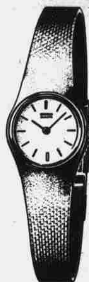
No. YL124M-$250.00. Yellow top/stainless steel back, gilt dial, HARDEX mar-resist crystal.